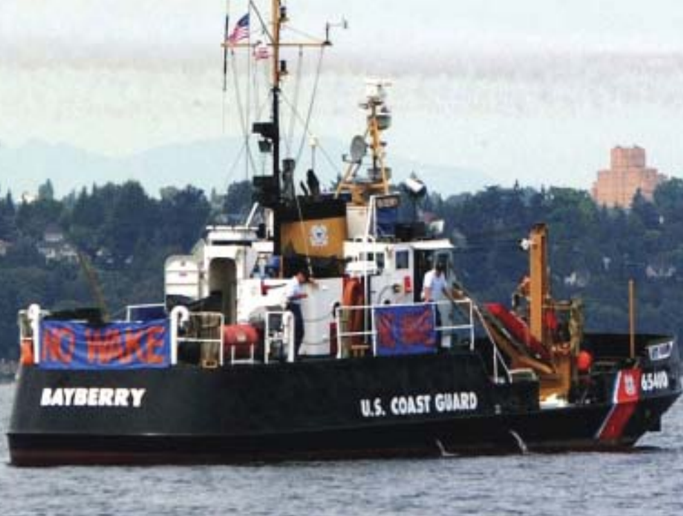
The Inland Buoy Tender, Coast Guard Cutter Bayberry , enforces a safety zone while the U.S. Navy "Blue Angels" perform at Seattle's 2003 Seafair.