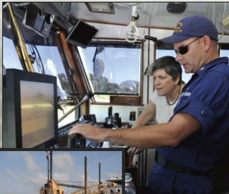
DHS Secretary Janet Napolitano observes aids to navigation operations aboard the Inland Construction Tender Anvil .