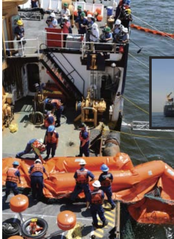
CGC Juniper's spilled oil recovery system.