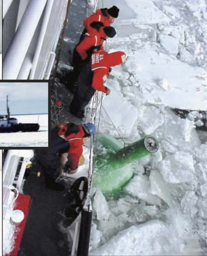
CGC Katmai Bay breaks ice to service an extinguished ice buoy.